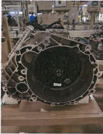
Image of Finished AAT product