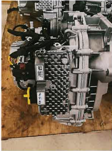
Image of Finished AAT product